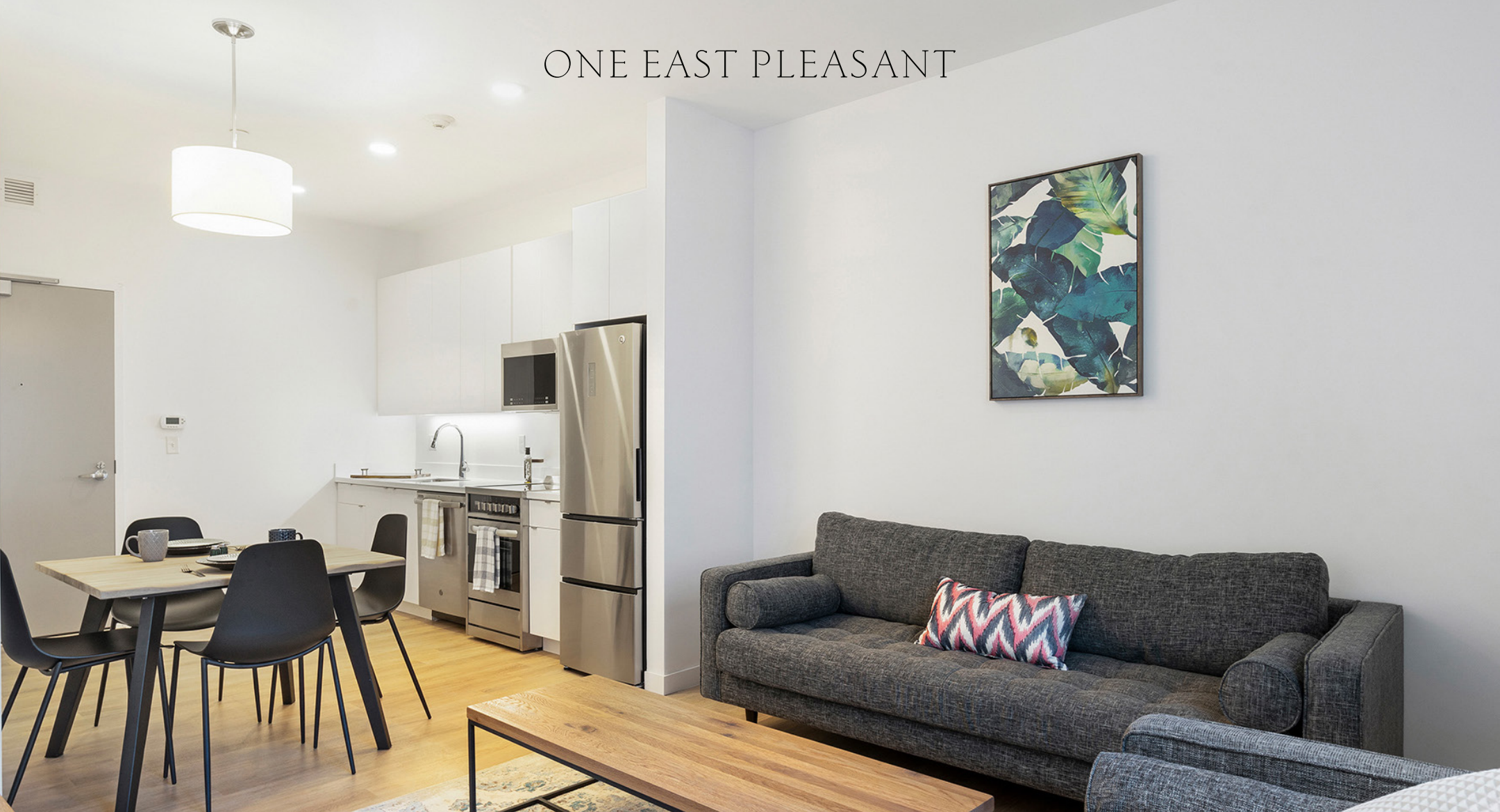
24/7 Fitness Center