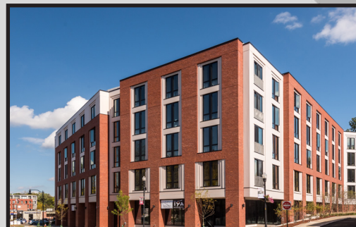
ONE EAST PLEASANT