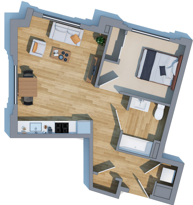
B6 576 Sq. Ft