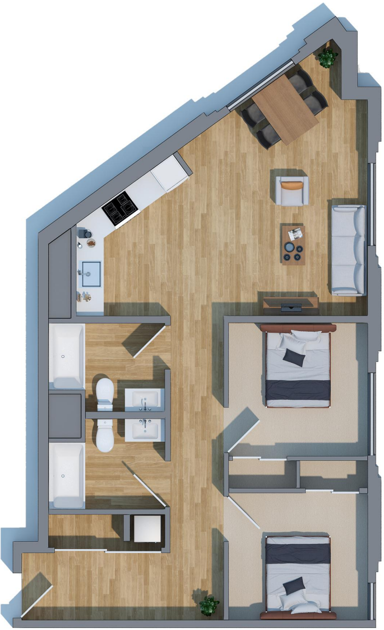
C1 968 Sq. Ft