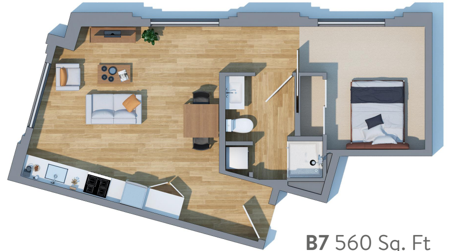
B7 560 Sq. Ft