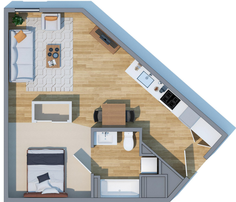
A4 524 Sq. Ft