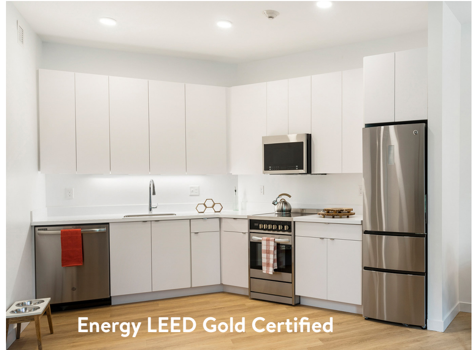
Energy LEED Gold Certified