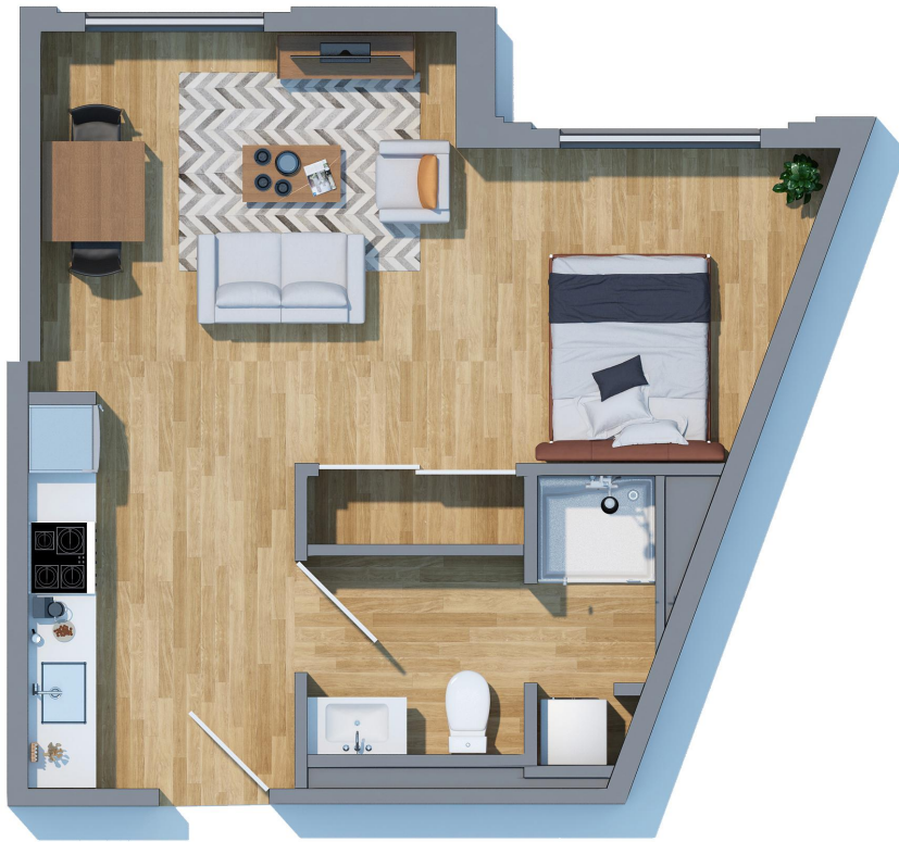
A5 497 Sq. Ft

*Furniture is only for reference and is subject to change. Other floor plans available. Not to scale.*