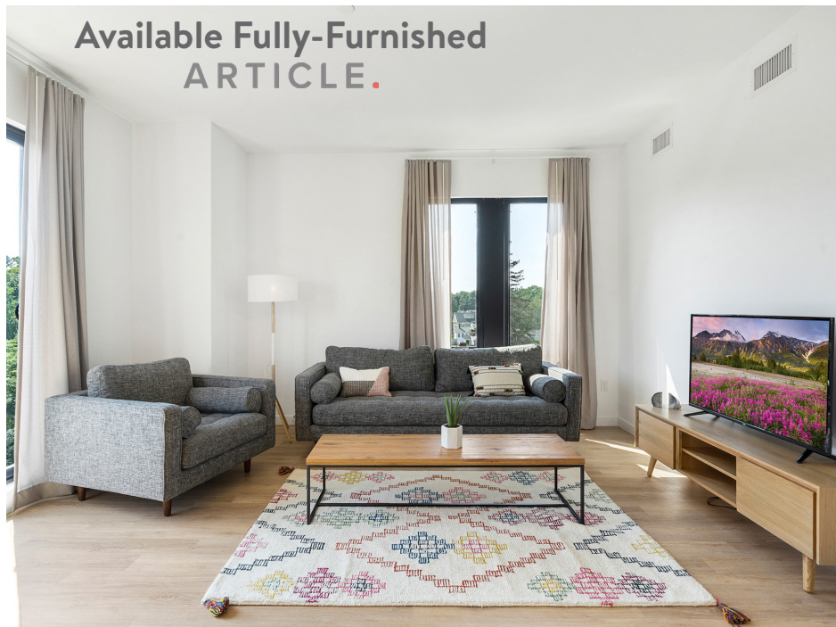
Available Fully-Furnished ARTICLE.