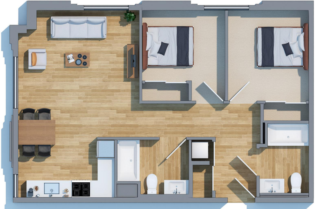
C2 881 Sq. Ft

*Furniture is only for reference and is subject to change. Other floor plans available. Not to scale.*